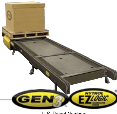
U.S. Patent Numbers 5,862,907 • 7,243,781 • 7,591,366 Other Patents Pending.