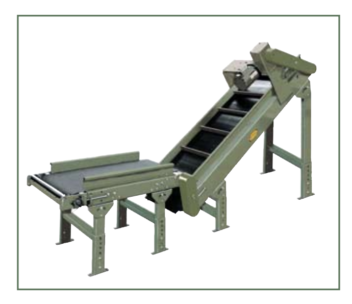
FEEDER SHOWN WITH STANDARD PC TYPE GUARD RAIL, GRAVITY BRACKET WITH POP-OUT ROLLER AND OPTIONAL MS TYPE FLOOR SUPPORTS

CAPACITY –300 lbs. total distributed load at 65 FPM.