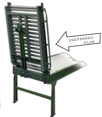
Photo shown is Spring Balanced Gate for 1 3/8 in. dia. roller conveyor.