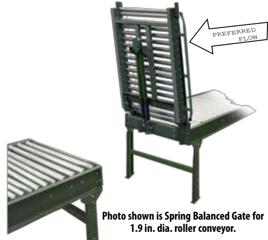
Photo shown is Spring Balanced Gate for 1.9 in. dia. roller conveyor.