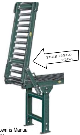
Photo shown is Manual Gate for 1 3/8 in. dia. roller conveyor.

*NOTE: Maximum width and length determined by roller centers and type of roller. Inquire.